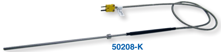
50208-K Fry Vat Probe