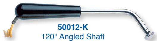
50012-K 120° Angled Shaft Surface Bell Probe