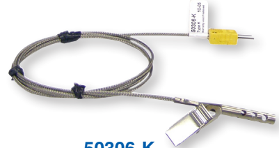
50306-K Oven / Freezer Probe