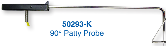
50293-K 90° Patty Probe