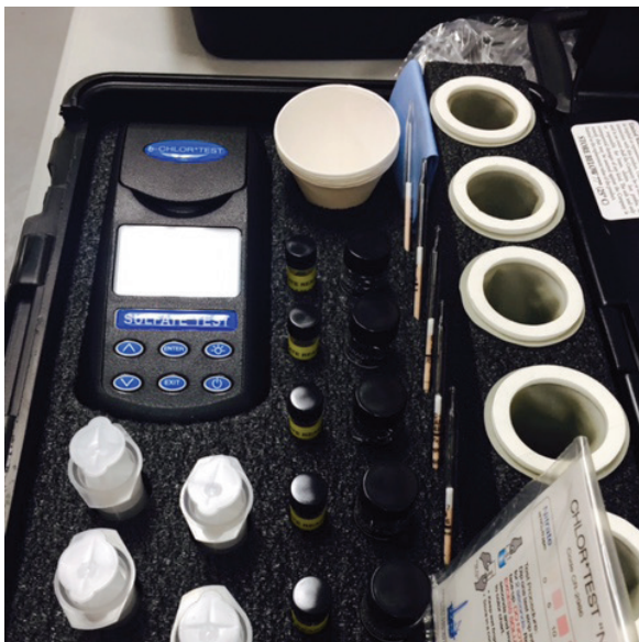
All components are pre-measured and pre-dosed for accuracy.

Quantitative results are achieved in minutes. Each kit contains (5) individual tests with new refill kits available.