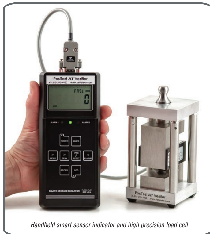
Handheld smart sensor indicator and high precision load cell