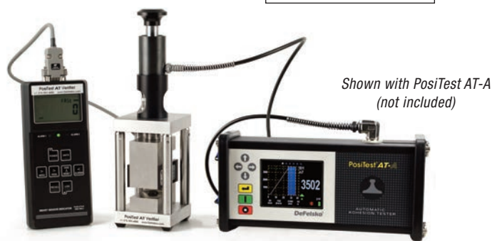
Shown with PosiTest AT-A (not included)

Note: Device displays Imperial units only.