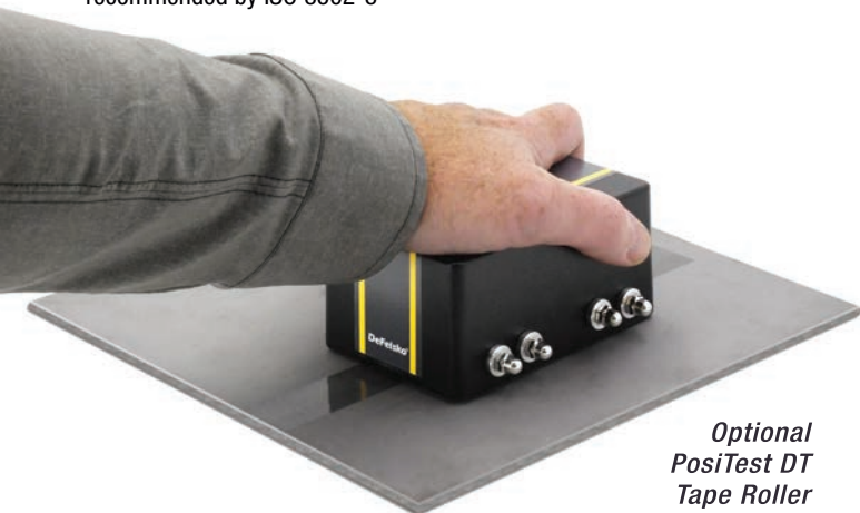
Optional PosiTest DT Tape Roller

Conforms to ISO 8502-3, AS 3894.6, US Navy PPI 63101-000