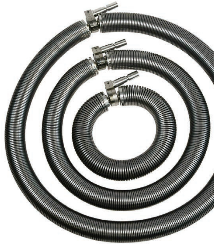
Rolling Spring Electrodes

For a complete list of available electrodes visit www.defelsko.com/hhd