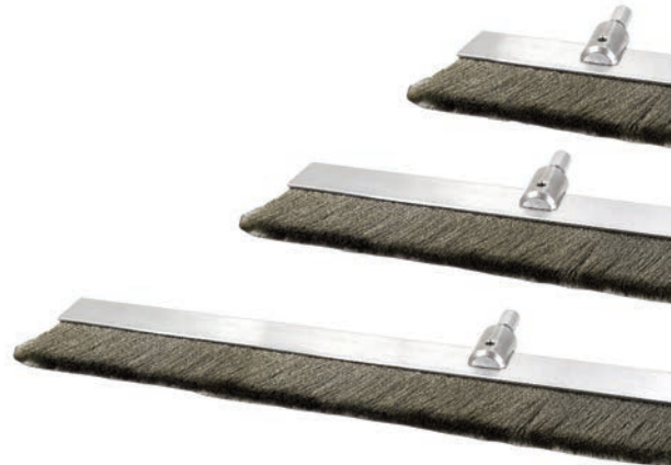
Flat Wire Brush Electrodes

Please Note: Each spring includes two pre-installed spring couplers. A spring connector (HHDCONNECT) is required to attach the PosiTest HHD to the spring couplers. Custom sizes and bulk pricing available. Additional couplers (HHDCOUPLER - 2 pack) are available.