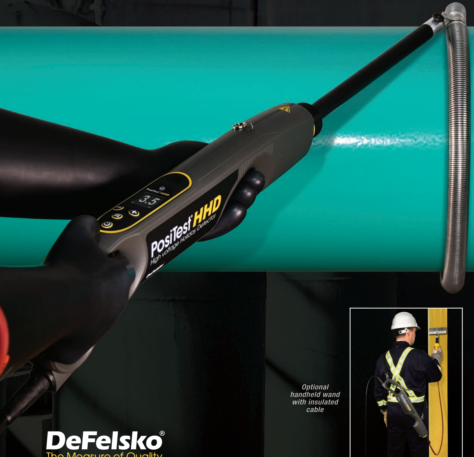
Optional handheld wand with insulated cable

Detects holidays, porosity, pinholes, leaks, and other discontinuities using pulse DC