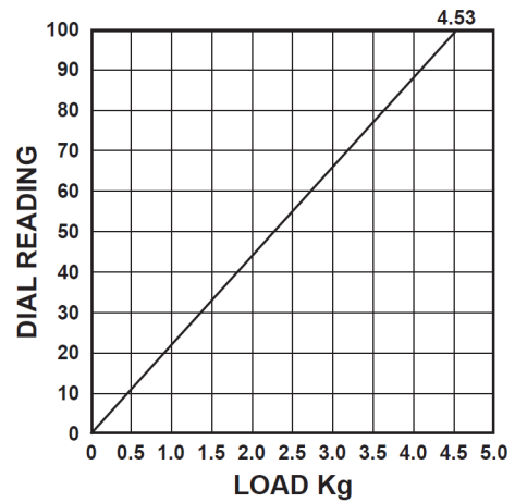
Force curve for Model 307L (ASTM D2240 Type D)

Place the specimen on a hard, horizontal surface. Set the ancillary hand of the durometer below 5 points on the dial. Hold the durometer vertically with the point of the indenter at least 1/2" from any edge. Apply the presser foot to the specimen as rapidly as possible, without shock, keeping the foot parallel to the surface of the specimen. Apply just sufficient force to obtain firm contact between the presser foot and the specimen. Hold for 1 or 2 seconds, the maximum reading can be obtained from the ancillary hand. If other than a maximum reading is needed, hold the durometer in place without motion and obtain the reading after the required time interval. Make 5 tests at least 1/4" apart and use the average value.