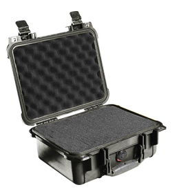
1400WF With Foam