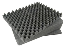
1521 3 pc. Replacement Foam Set