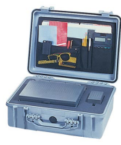
1509 Lid Organizer