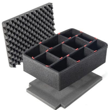
1520TPKIT TrekPak Case Divider Kit