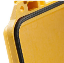
1523 Replacement O-ring