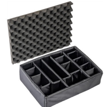
1525 Padded Divider Set