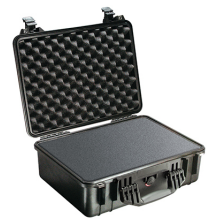
1520WF With Foam