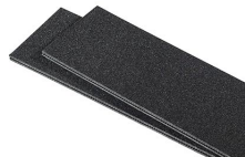
1520TPDIV Extra TrekPak Dividers