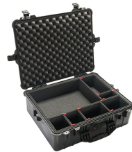
1600TP With TrekPak Divider System