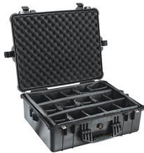
1604 With Padded Dividers