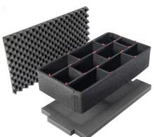
1600PKIT TrekPak Case Divider Kit