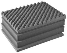
1601 4 pc. Replacement Foam Set