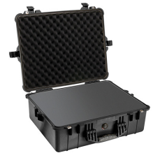
1600WF With Foam