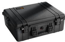
1600NF No Foam