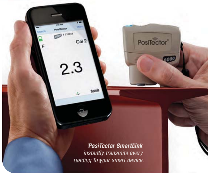
PosiTector SmartLink instantly transmits every reading to your smart device.

Share professional PDF reports and CSV data instantly via email, Dropbox, AirPrint™ or other applications on your device.