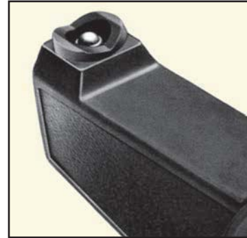
Carbide measuring probe for long life.

FOR: Hot dip galvanizing, hard chrome metalizing, paint, enamel coatings on steel