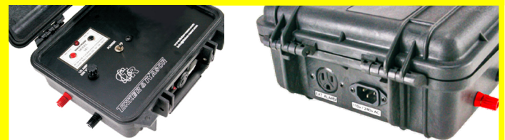
Model M1/AC shown with connection on side of case. AC connection and external alarm connection on back of instrument case. External alarm can be used for audible or visual holiday indicator.

Custom Electrodes Suitable for internal and external coatings on metal and concrete structures