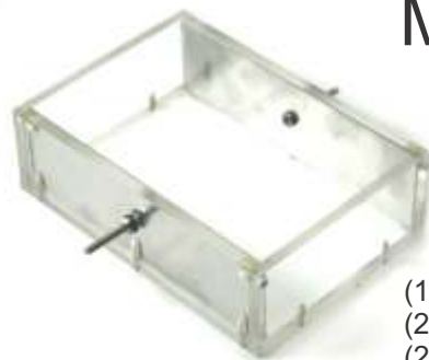
Model SB-2 Soilbox

4 cm H x 6 cm W x 23.75 cm L (Inside Dims) (1.575" H x 2.362" W x 9.350" L) (Inside Dims) Conforms to ASTM G57, G187